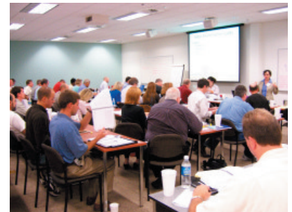
LEED Technical Review Workshop September 2006